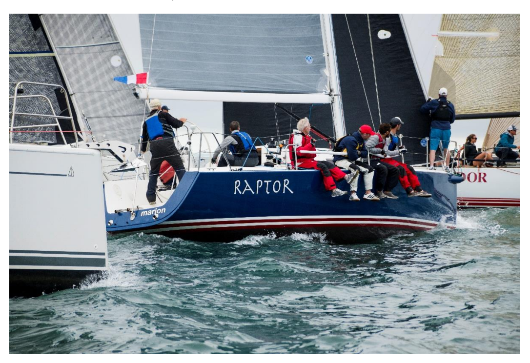
The J/29 Seefest, J/46 Wings and J/109 Raptor will be back this year.

Sailors can choose to sail on all three days or just in one or the other of the distance races. Either way, there's something for everyone and something extra for J/Boat teams in the 'RTI race. A three-boat team, representing any given yacht club and with PHRF-NE rated entries in more than one division, qualifies for first, second-, and third-place trophies based on best-corrected times. As well, there are top-three prizes for the best individual corrected time out of all J/Boats in the 'RTI.