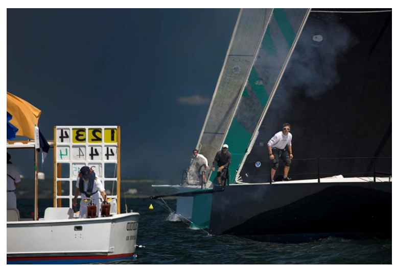
IRC 52s at Edgartown Race Weekend's 'Round-the-Buoy Races in 2014.

EDGARTOWN, MASS., MARTHA'S VINEYARD (March 18, 2015)— It really can't get any better – two days of 'Round-the-Buoy Races in dependable breezes on outer Edgartown Harbor followed by a legendary 'Round-the-Island Race that circumnavigates the breathtaking 100-square-mile island retreat of Martha's Vineyard.